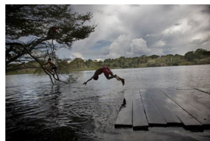
The people of the Xixuau

That's all for now. Once again we thank all those who have contributed in some way to the projects of the Amazon Association, and thus helped us in our mission to preserve and safeguard this incredible area of untouched rain forest.